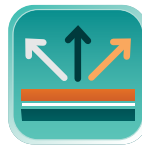
MULTIPLE SURFACE SOLUTIONS