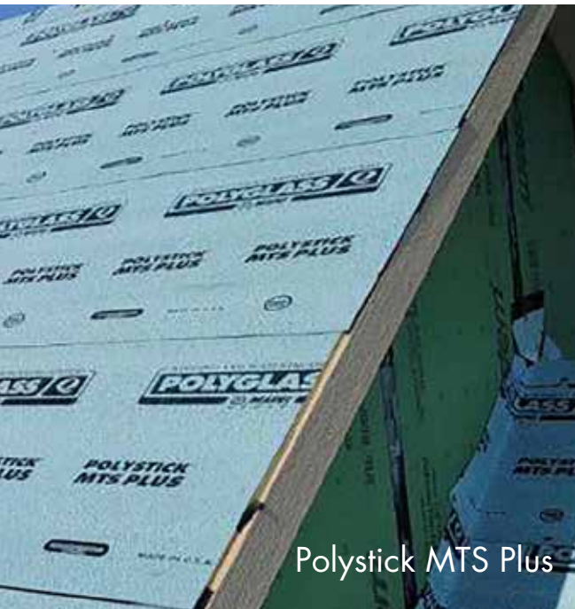
Polystick MTS Plus